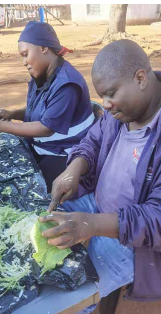
Page 3 | The goal remains ZERO-HARM! Khumbul'ekhaya